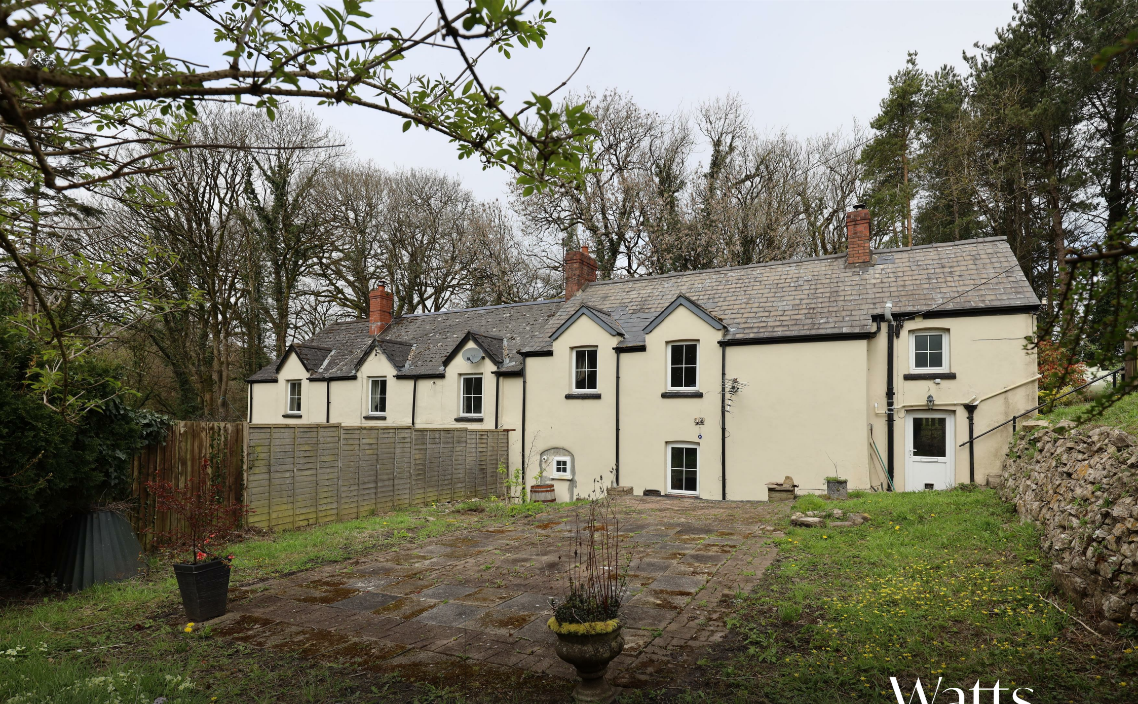
1 Woodhouse Cottage, Fonmon, Nr Barry, Vale of Glamorgan, CF62 3BL